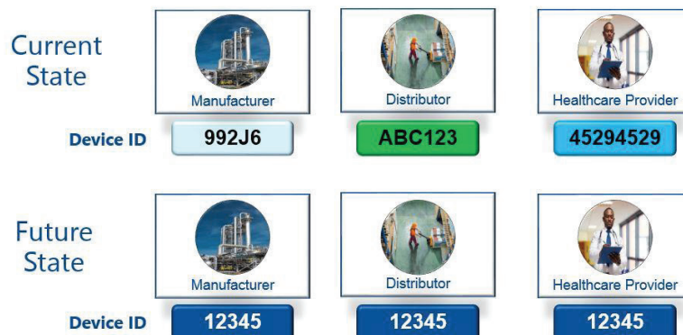
Current and Future State of Medical Device Identification

To address these concerns, an inclusion in the FDA Amendments Act called for establishment of a UDI system for medical devices. The key requirement being for manufacturers and brand owners to establish globally unique device identifiers for all finished medical devices distributed in the United States.